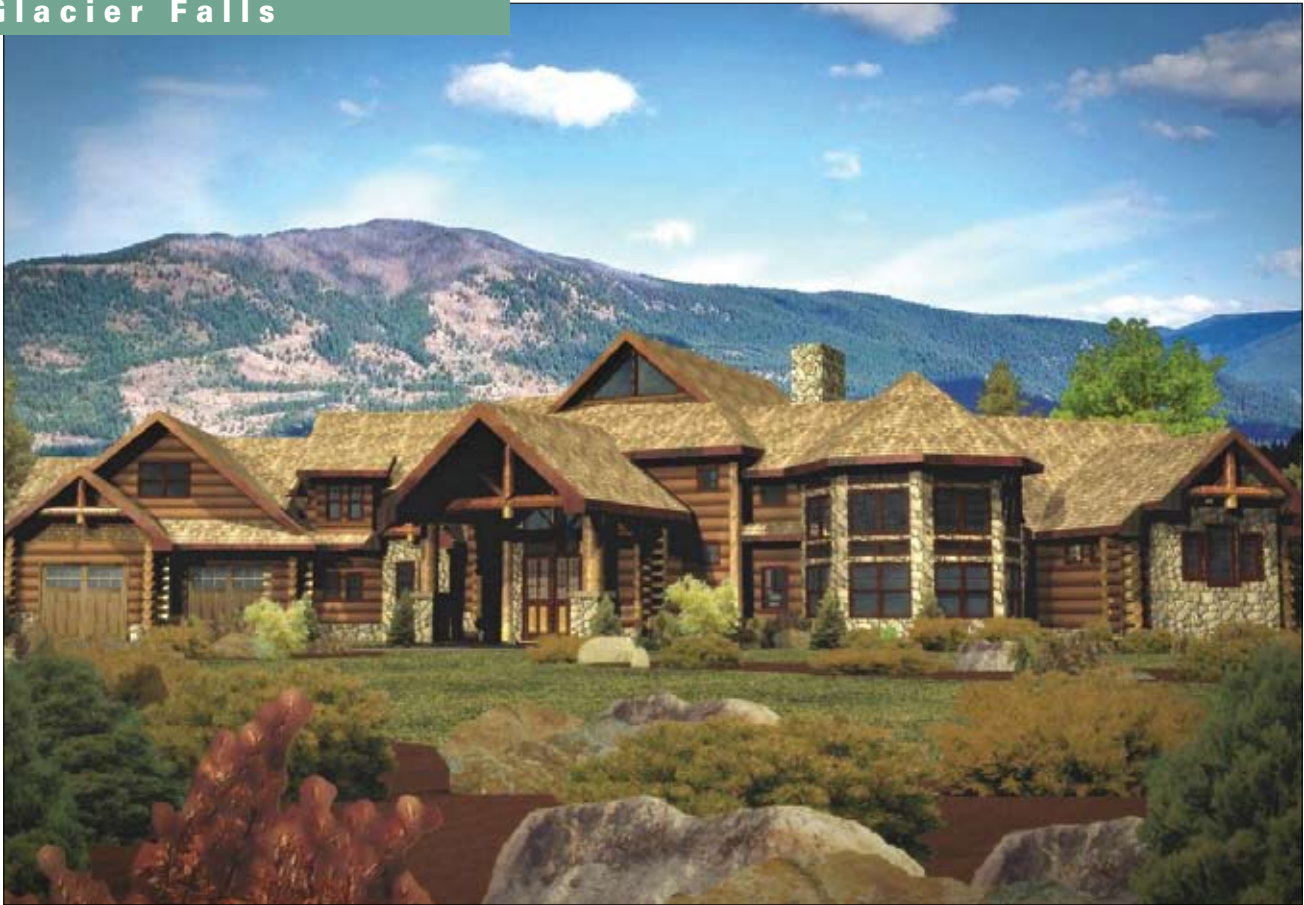
MODEL: Glacier Falls

FIRST FLOOR: 4,225 SECOND FLOOR: 2,811 SQUARE FOOTAGE: 7,036