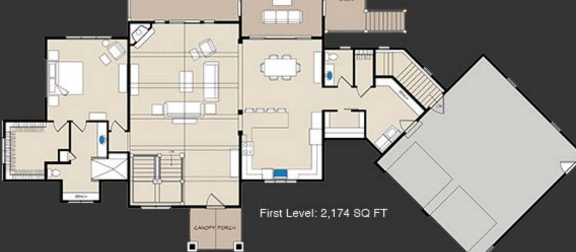
First Level: 2,174 SQ FT

PERSONALIZE THIS PLAN TO FIT YOUR NEEDS AND STYLE.