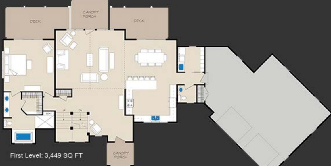
First Level: 3,449 SQ FT