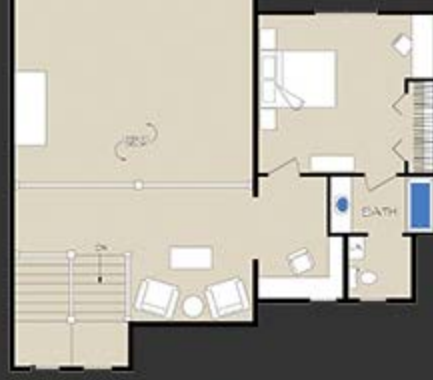
Lower Level: 5,131 SQ FT