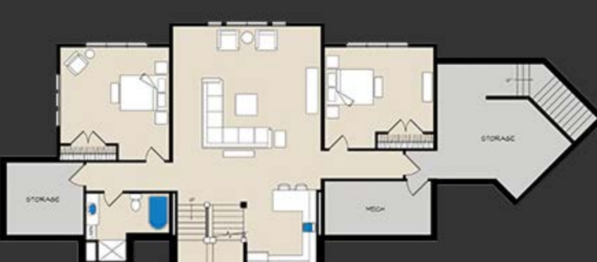
Lower Level: 1,871 SQ FT