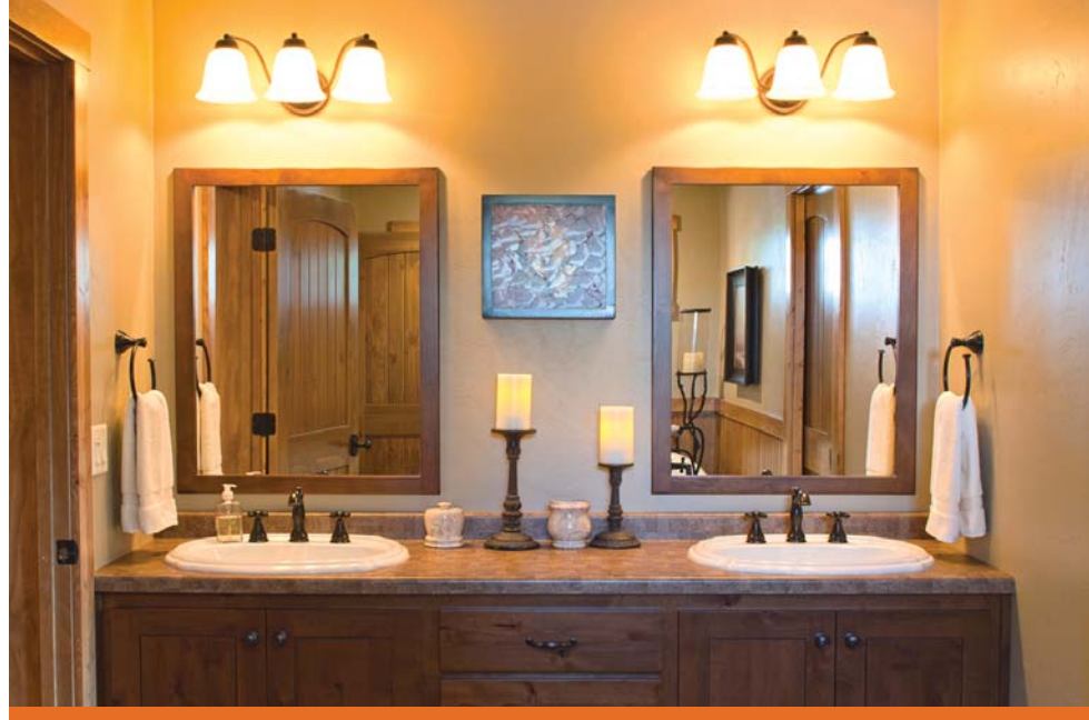
THE UPSTAIRS JACK AND JILL BATHROOM IS SPACIOUS AND COMFORTABLE FOR GUESTS, WITH SOFT LIGHTING AND WARM NEUTRAL TONES FOR THE DECOR.