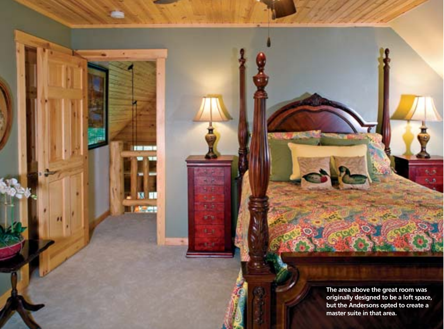
The area above the great room was originally designed to be a loft space, but the Andersons opted to create a master suite in that area.