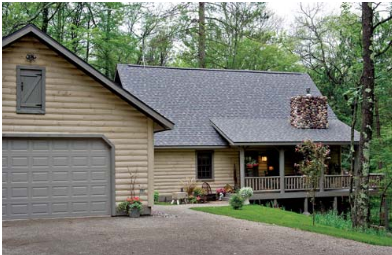
With an exterior beige-gray stain (called Silver Birch), the 2,343-square-foot, three-bedroom home blends nicely into the surrounding woodlands. A Sansin Alder Gray trim stain adds to the natural motif. The exterior logs are all 8-inch pine.