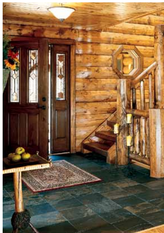
CLOCKWISE FROM ABOVE: Both rustic and romantic, the master bedroom displays French country flavor with a handcrafted wrought-iron bed and nature-inspired bedding. Glass doors give direct access to the outdoor patio from this private retreat. Compact yet functional, the efficient kitchen offers modern style in a comfortable environment for entertaining and everyday living. A dramatic log staircase and slate tile flooring highlight the foyer.