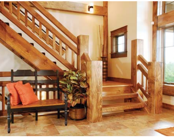
A Green Bay hybrid features elements of stone, timber, and Sheetrock. Breakthroughs in engineering and material design in the past two decades allow opportunities for homeowners to merge a variety of architectural styles.