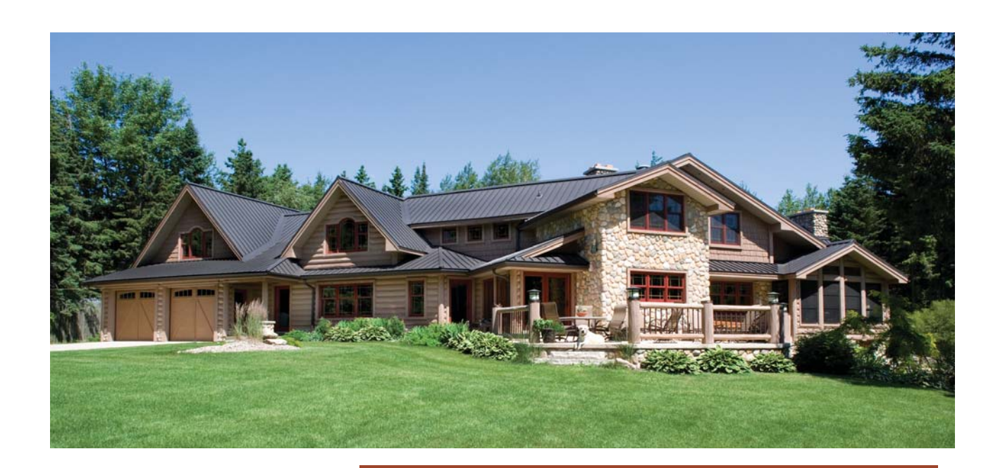
Above: The Wisconsin Log Homes Boulder Ridge plan was customized by the homeowners to incorporate architectural stone, shingles, and logs.

ing construction or homeowners will experience a host of problems down the road. In addition, vertical support posts must be adjusted as the log walls settle through the years, or they can raise havoc with the second floor and