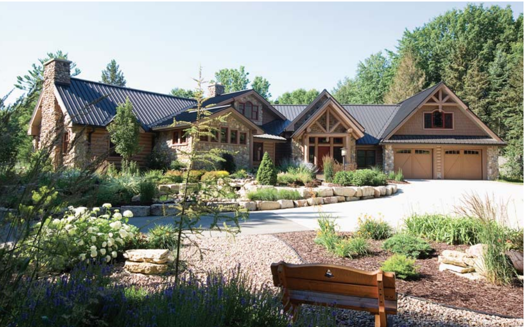
Above: Another view of the Boulder Ridge plan. A metal roof and additional insulation help reduce energy costs for this Northwoods hybrid.