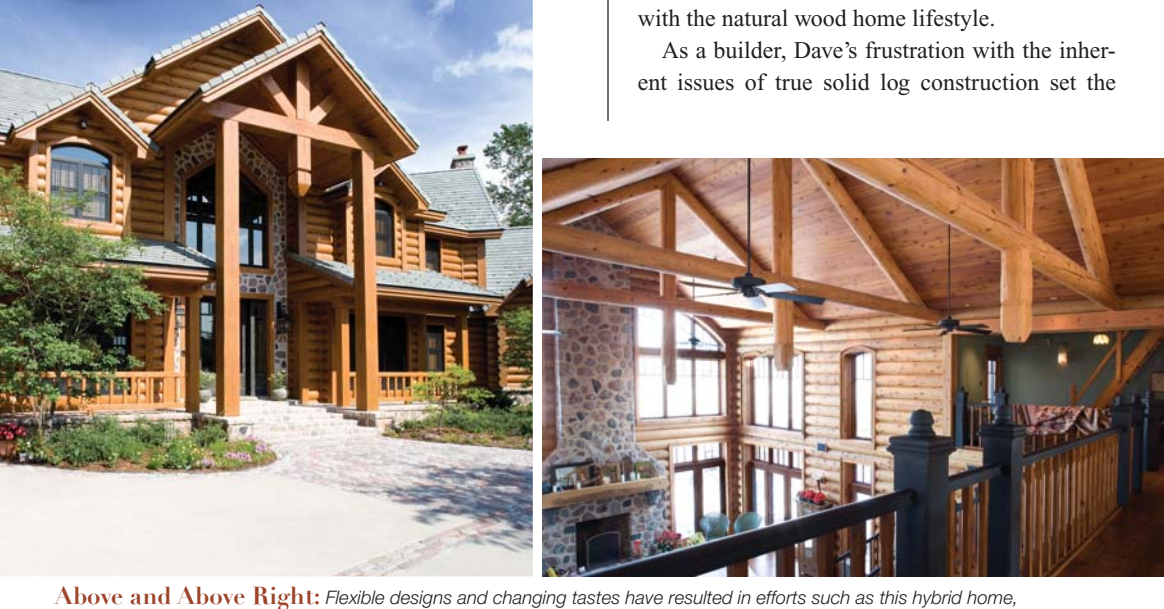
which features a modified two-story Lodge-style entry, structural log trusses, and energy-efficient construction that cuts back on heating and cooling costs.

Three decades ago, energy shortages, the Vietnam War, and political upheavals loomed over the economy. People wanted to escape the cookie-cutter world of brick houses and had fallen in love with the natural wood home lifestyle.