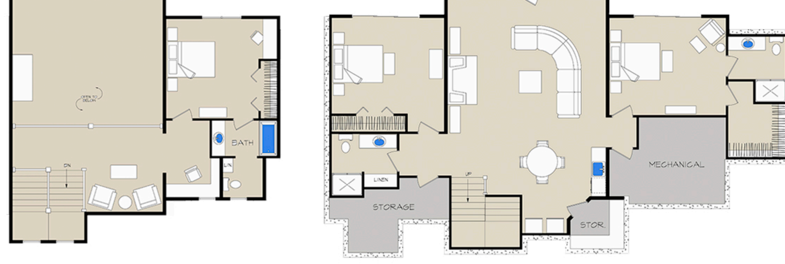
SECOND FLOOR: 534 SQ. FT.