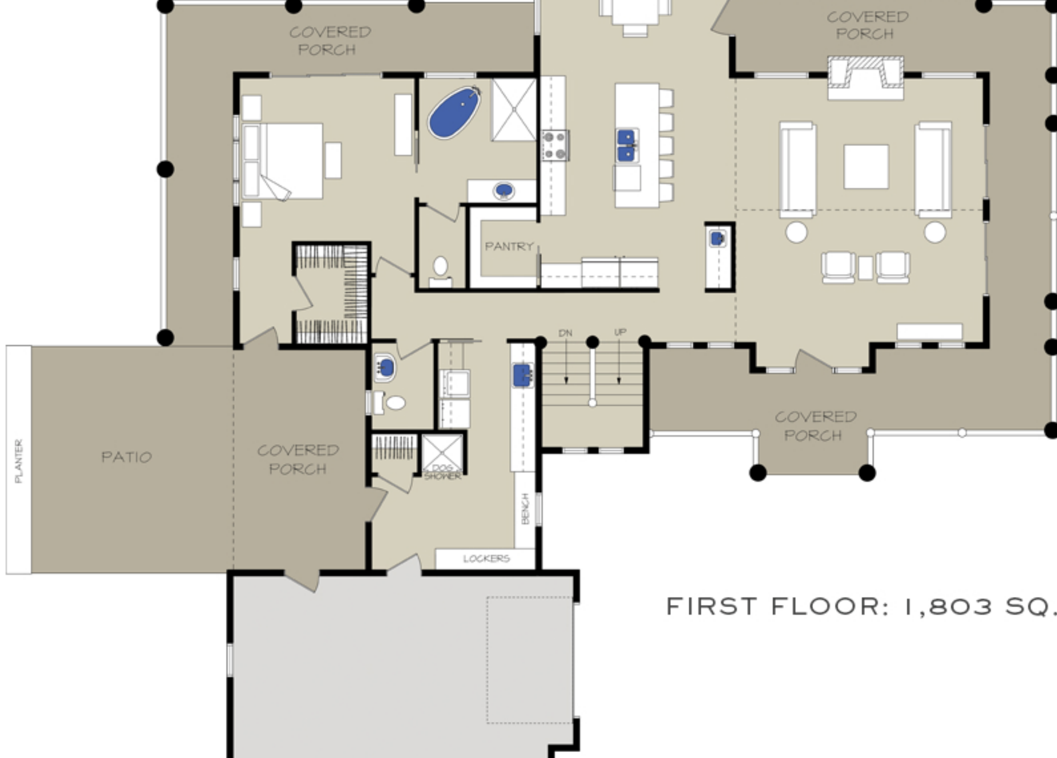
FIRST FLOOR: 1,803 SQ. FT.

OUR CUSTOM DESIGNS ARE SIMPLY MEANT TO INSPIRE YOUR DREAM HOME VISIONS. MODIFY THIS PLAN IN SIZE, LAYOUT AND STYLE TO FIT YOUR PERSONAL NEEDS AND PROPERTY, OR START COMPLETELY FROM SCRATCH ON A NEW DESIGN.