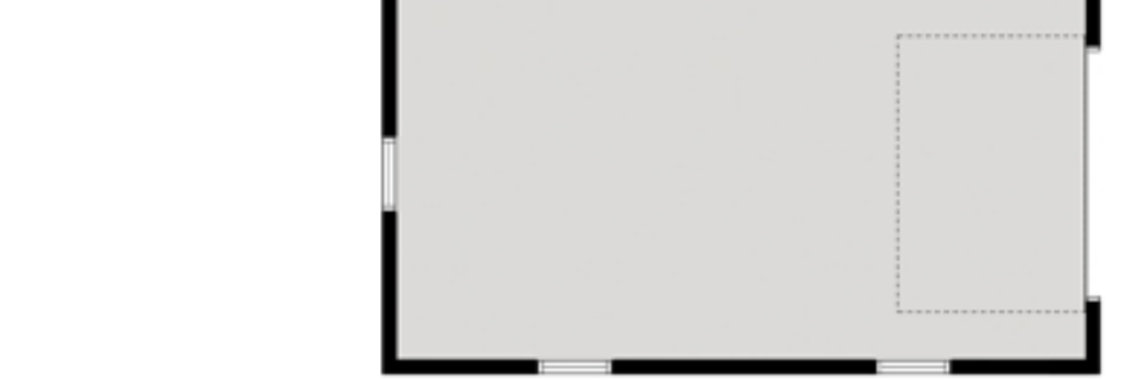
SECOND FLOOR: 1,433 SQ. FT.