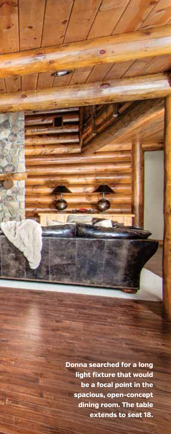
Donna searched for a long light fixture that would be a focal point in the spacious, open-concept dining room. The table extends to seat 18.