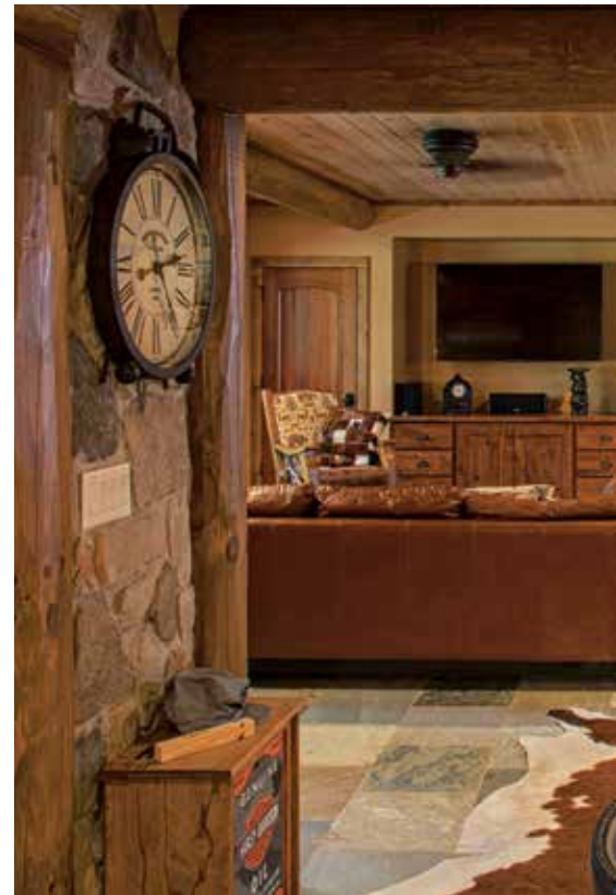
ABOVE: Every floor, including the natural slate in the lower-level living room, has radiant in-floor heat with back-furnaces that engage until the radiant heat kicks in.