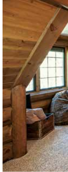
RIGHT: The walls of the guest suite are encased in northern white pine logs. The lowered ceiling and alcove create the feeling of a cabin within a cabin.