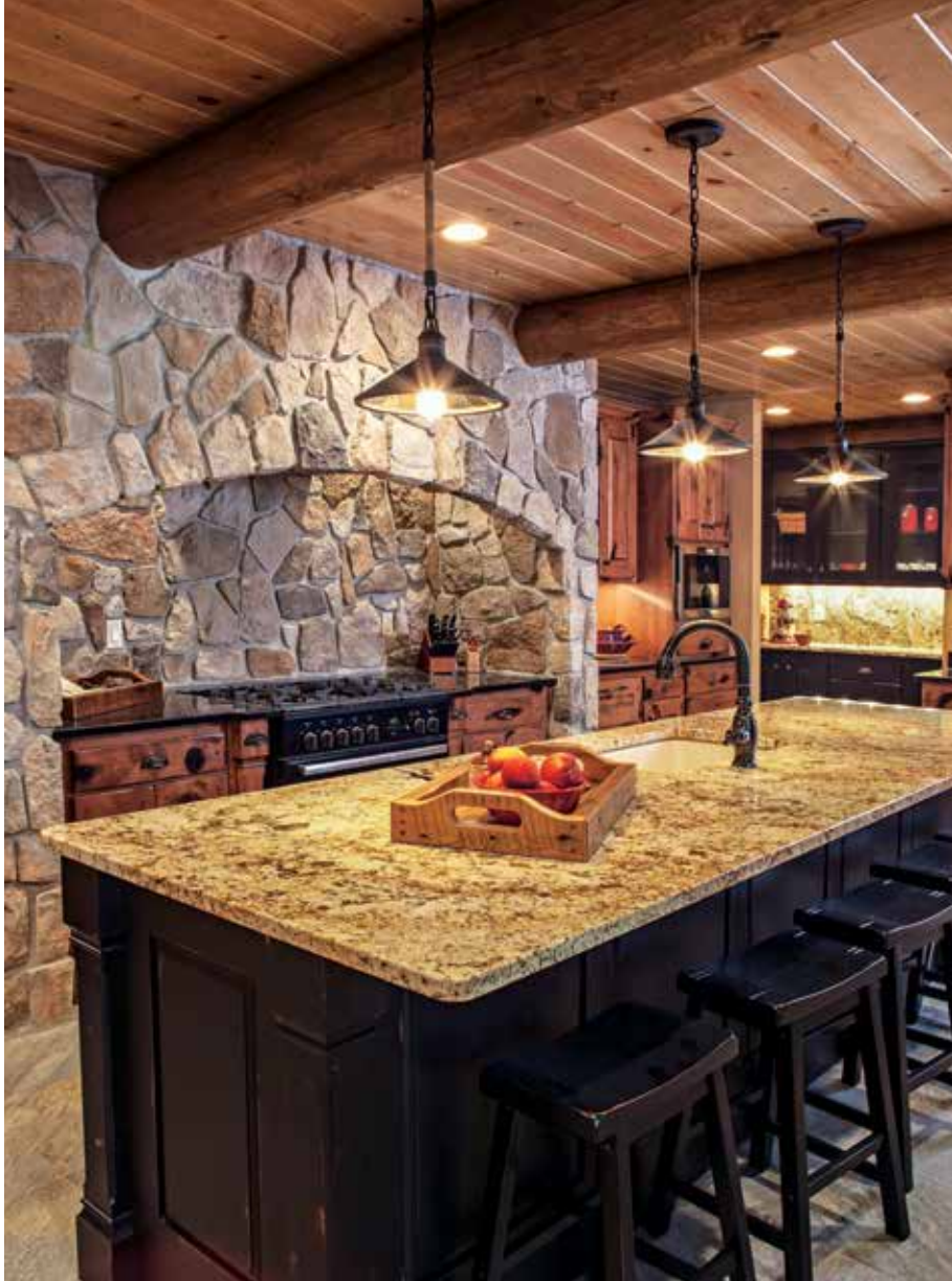
LEFT: Even though the Pernacciaros love to cook with company, visitors and extended family can make their own meals in the home's second full kitchen located on the lower level.