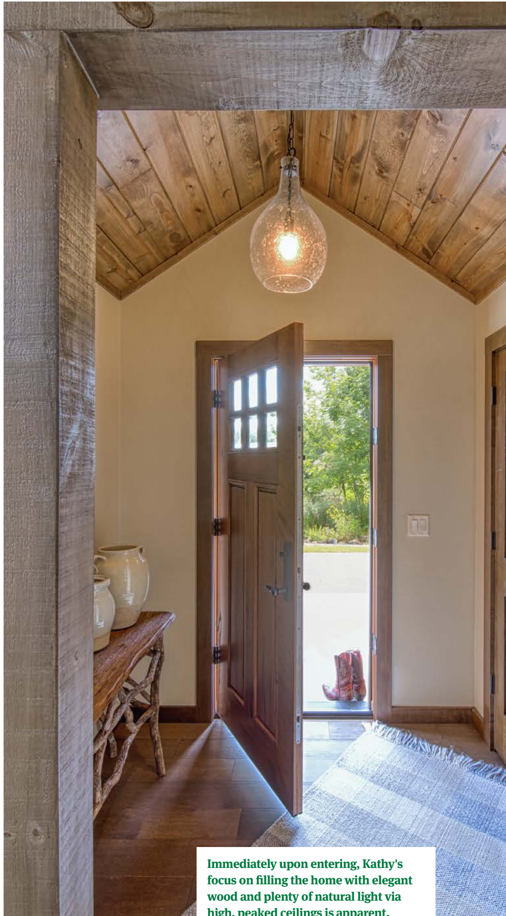
Immediately upon entering, Kathy's focus on filling the home with elegant wood and plenty of natural light via high, peaked ceilings is apparent.

The couple turned their sights to building out the homestead, but there were a few other projects that had to happen before they could realize their dream of building: the barn needed a new foundation, and they had to convert the “pig barn” into a small guest house where they could live during construction. Lastly, they had to take down the old farmhouse that had fallen into disrepair.