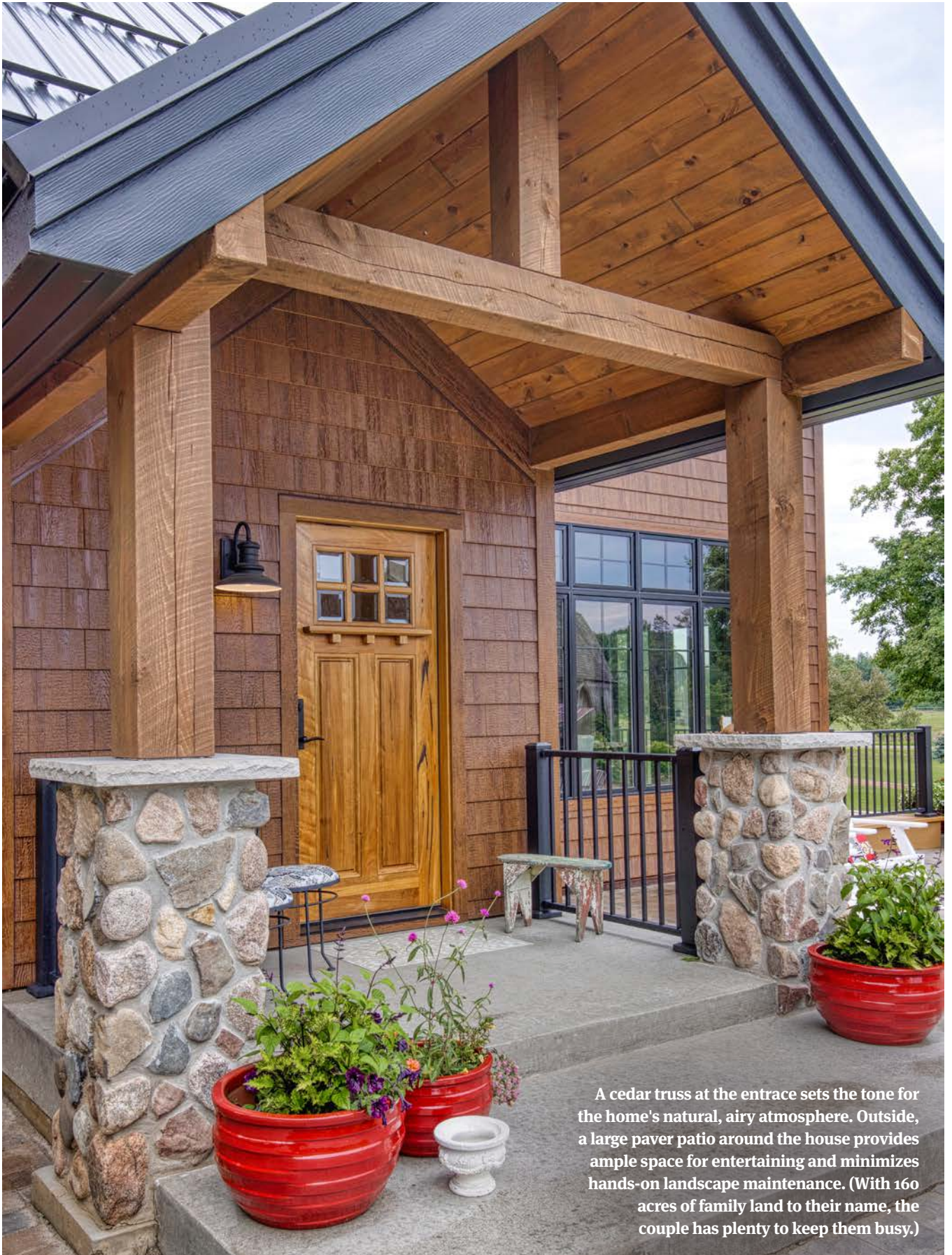
A cedar truss at the entrance sets the tone for the home's natural, airy atmosphere. Outside, a large paver patio around the house provides ample space for entertaining and minimizes hands-on landscape maintenance. (With 160 acres of family land to their name, the couple has plenty to keep them busy.)