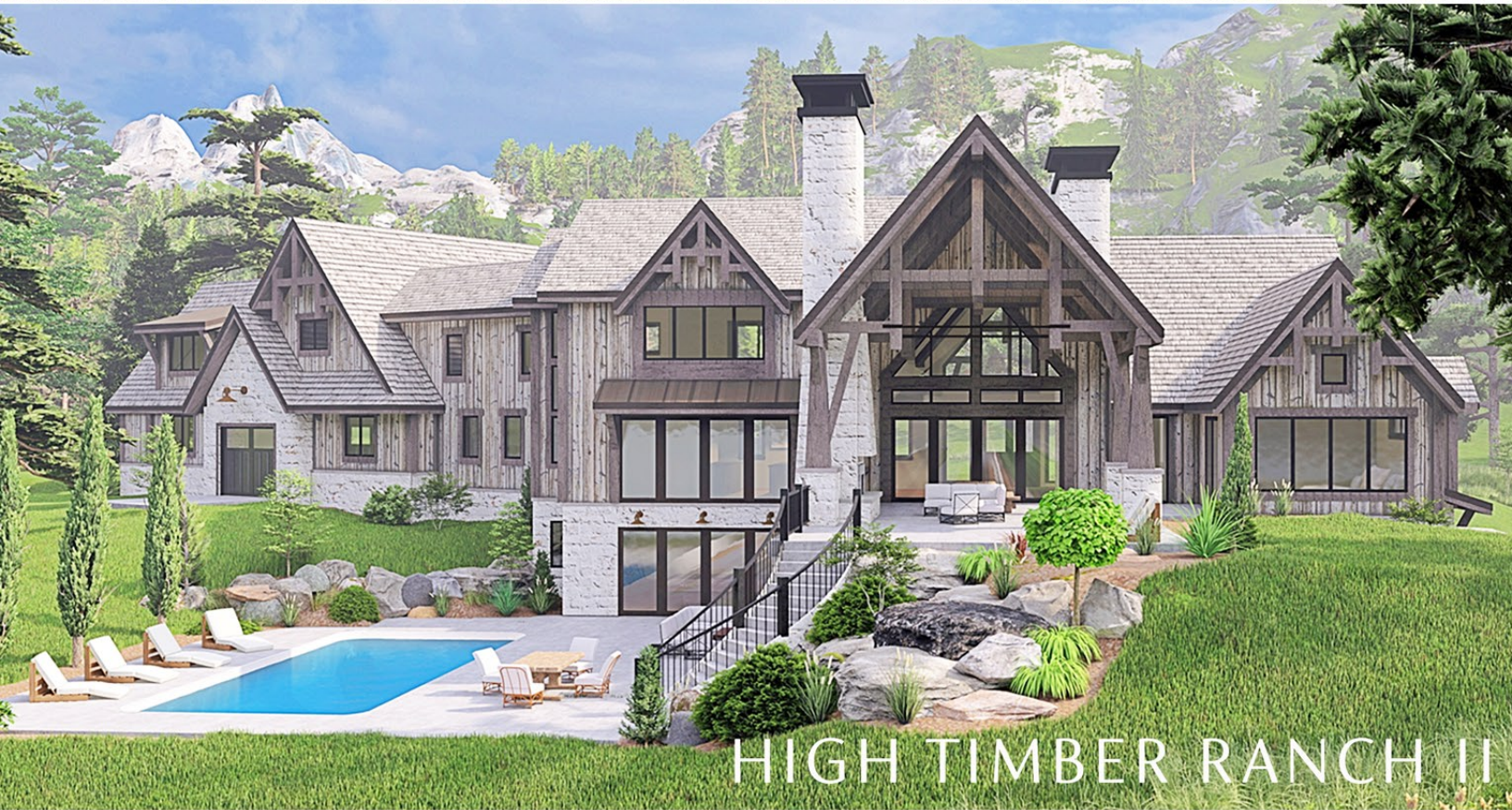
HIGH TIMBER RANCH II