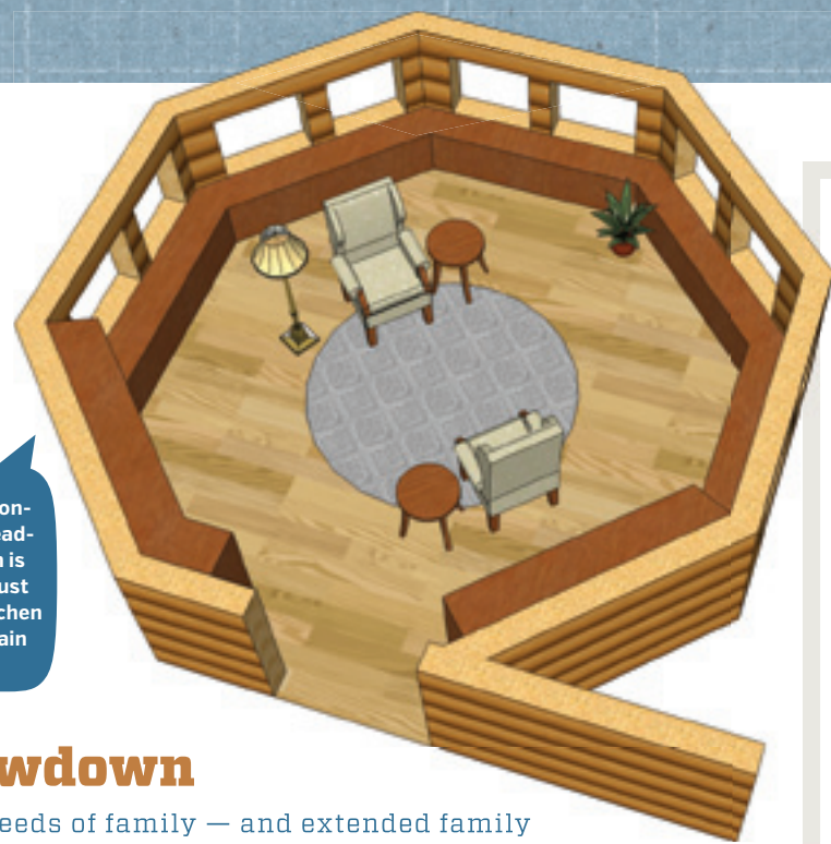
An octagon-shaped reading room is located just off the kitchen on the main level.